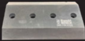
(Model 12XP Knife)