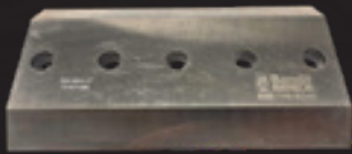
(Model 19XPC Knife)