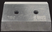
(Model 90XP Knife)