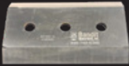
(Model 200XP Knife)