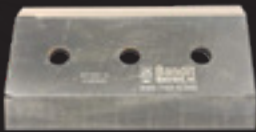
(Model 200XP Knife)