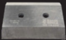
(Model 90XP Knife)