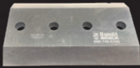
(Model 12XPC Knife)