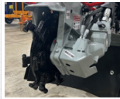
Bandit Wheel with 16 Greenteeth