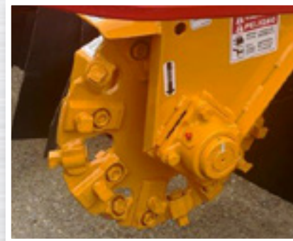
New Revolution Wheel with 24 Hex Teeth